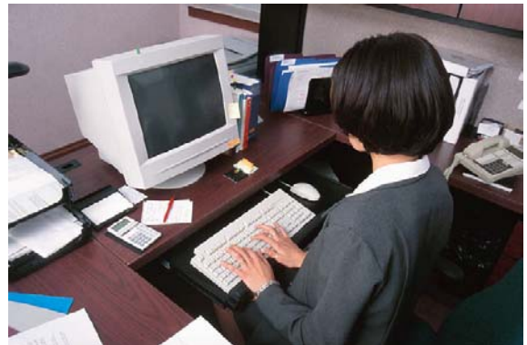
An LDS person can have the freedom and safety in contacting our website and discover the real truths about Jesus and their salvation

I pray for the launching of the new website, www.thecityofzion.com . Lead members of the Mormon to church to check out and read the information carefully. Open up their hearts and minds to the power of your Word. Allow them to let go of any fears or pressures from the family or the church that will cause them to stay in Mormonism. Be with those e-mail witnesses who will be in contact with people from the new website. May they speak the truth in love.